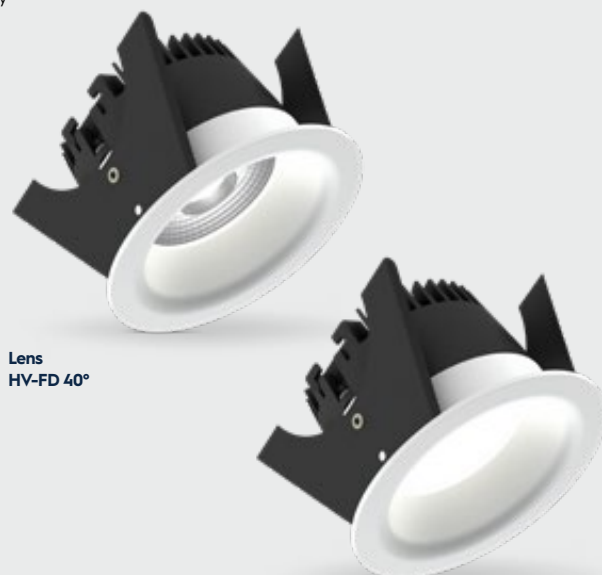
Lens HV-FD 40°